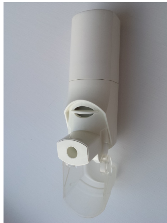
Figure 1 Spiromax device.

The Spiromax® device (Figure 1) is a novel DPI. DuoResp® Spiromax (budesonide plus formoterol [BF] Spiromax) is approved for use in the European Union for treatment of adults ( \geq 18 years old) with asthma and for patients with COPD for whom an inhaled corticosteroid/long-acting \beta_2 agonist (ICS/LABA) combination is indicated [18]. The formulations of BF in BF Spiromax provide comparable quality and are equivalent to BF (Symbicort®) Turbuhaler at equivalent strengths [18]. Regulatory approval of Spiromax was dependent on demonstration of