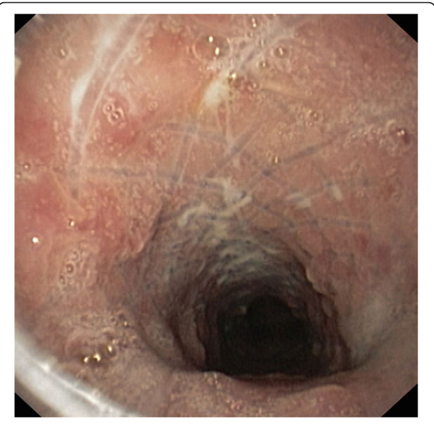
Fig. 4 Proximal portion of the stent 3 months after implantation. Inflammation and hyperplasia of mucosa is seen, fibers are partially covered by the mucosa

4 cm long irregular narrowing that affected the upper and middle portions of her trachea. Unabated alcohol intake, together with advanced hepatic cirrhosis, contraindicated tracheal resection. With the exception of minor expectoration difficulties, she did well with the silicone stent until November 2013, when she presented with a growth of granulation tissue and mucosal swelling above the proximal end of the stent. After removal of the stent, a significant residual stenosis persisted despite laser resection of the granulation and balloon