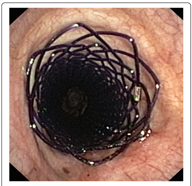
Fig. 3 BD stent in trachea immediately after implantation

dilation. We then inserted a BD stent, which very nicely reopened the narrowed segment; the patient reported a reduction in coughing and expectoration compared to the silicone stent. Thirteen weeks after implantation, the patient presented with dyspnea and stridor, together with a history consistent with a respiratory infection. We found significant narrowing caused by granulations protruding between the holes of the stent mesh. The stent integrity had been breached and several fibers