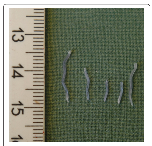
Fig. 5 Bits of fibers coughed up by one of the patients