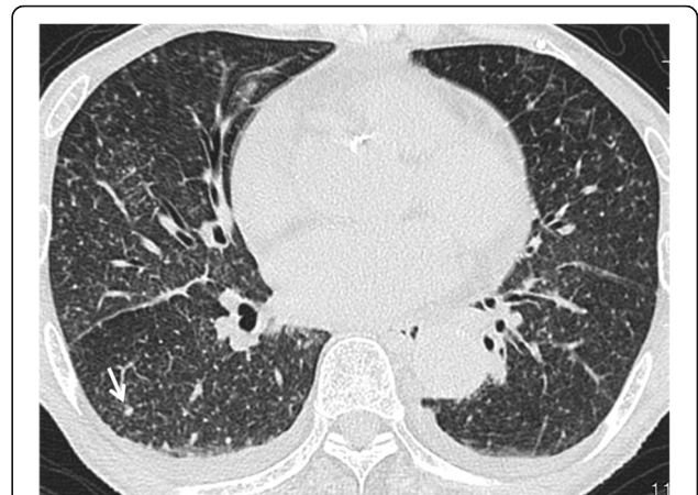
Fig. 2 Chest CT on admission showed diffuse micronodules at random pattern in both lung field and a small nodule in the right S6 (white arrow)