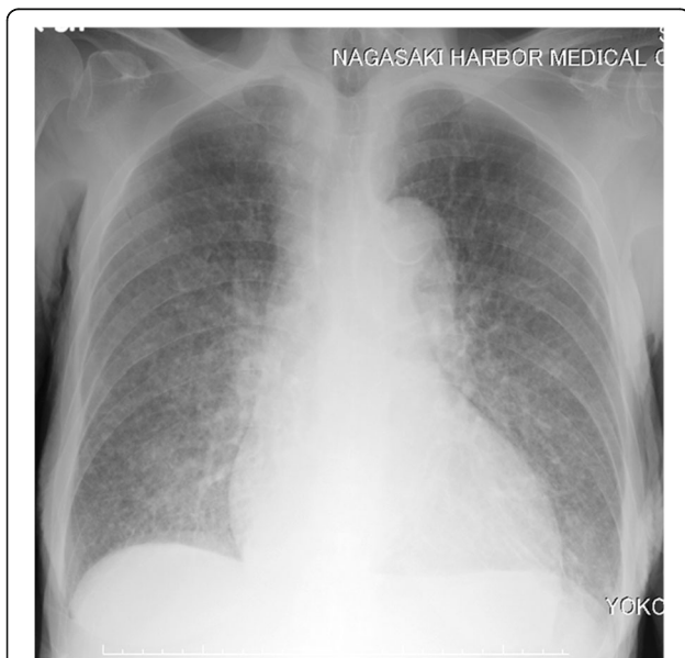
Fig. 1 Chest radiography on admission showed diffuse micronodules in both lung field

An 84-year-old woman presented to our hospital with complaints of a 1-week history of abdominal pain and appetite loss. The patient had no history of cough, sputum, fever, chills, weight loss, or night sweats. She had no history of tobacco smoking, tuberculosis or exposure to individuals with tuberculosis. She did not have a history of malignancy, diabetes mellitus, cytotoxic therapy or corticosteroid use. Her family history was unremarkable. Physical examination revealed a heart rate of 90 beats/min, blood pressure of 157/76 mmHg, respiratory rate of 24 breaths/min, temperature of 37.8 °C and oxygen saturation of 98% on room air. Respiratory, cardiac and abdominal examination were unremarkable. Chest radiograph showed multiple small nodules in both lung fields and chest computed tomography (CT) showed diffuse micronodules in random patterns in both lung lobes, cardiomegaly and bilateral pleural effusion (Figs. 1 and 2). White blood cell count, C-reactive