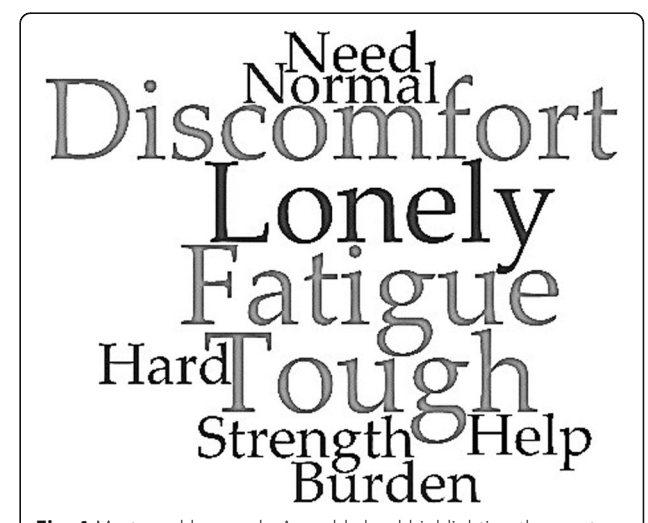
Fig. 4 Most used keywords. A world-cloud highlighting the most recurring and meaningful words used by participants to describe their current situation

The theme of illness experience has been logically considered as the origin of the other themes and includes the biggest part of the corpus. Therefore, the daily coexistence with limitations, emergencies, conflicting emotions, and debilitating symptoms qualifies these people as the real experts of COPD. Some of the aspects related to the illness perception have emerged: the different