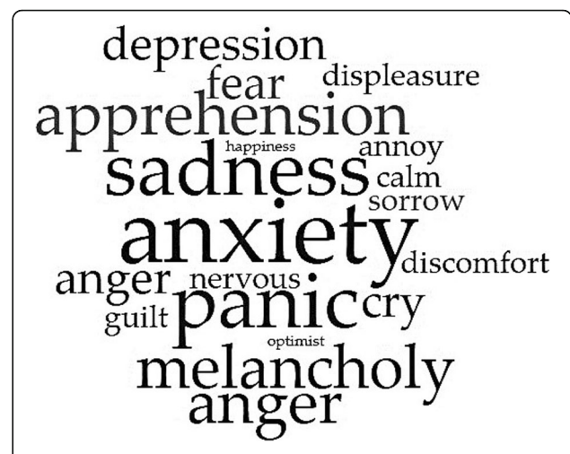
Fig. 3 Emotional experience. A word-cloud highlighting the most recurring and meaningful words used by participants to describe their emotional experience

Finally, the semantic analysis of the corpus resulted in two distinct word-clouds. In the following graphic outputs, words are shown as bigger when their occurrence in the text is higher. Respectively, they represent the emotional experience of participants (Fig. 3) and the ten most used keywords (Fig. 4).