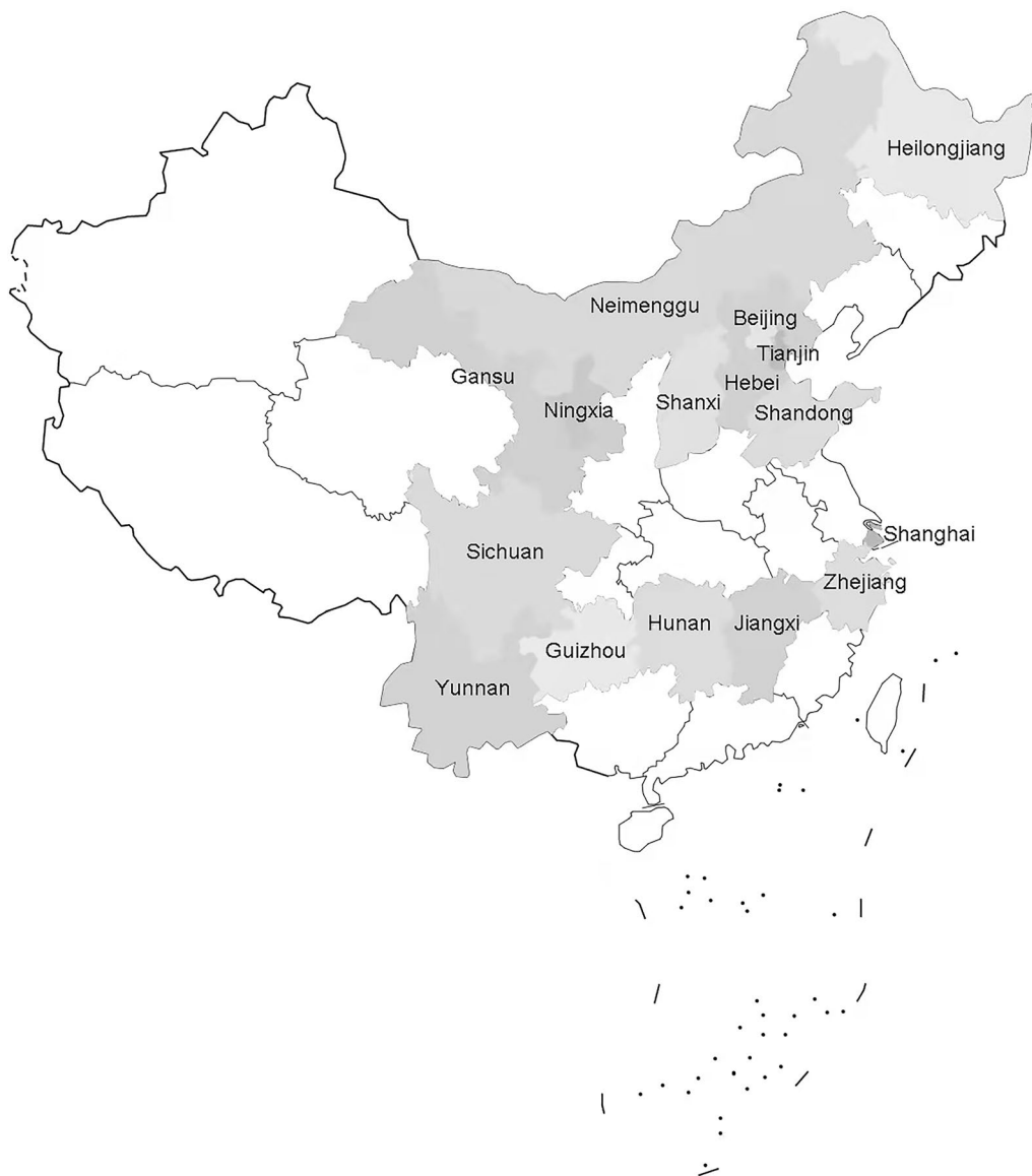
Fig. 1 Distribution of primary health care institutions surveyed across China

accounting for 25.7%. Of 144 PHC institutions, 80% were equipped with infrastructure for the diagnosis and treatment of respiratory diseases, 91% were equipped with commonly used drugs, 69.4% had medical personnel specialized in respiratory medicine, and 73.6% had carried out the diagnosis and management of chronic respiratory diseases.