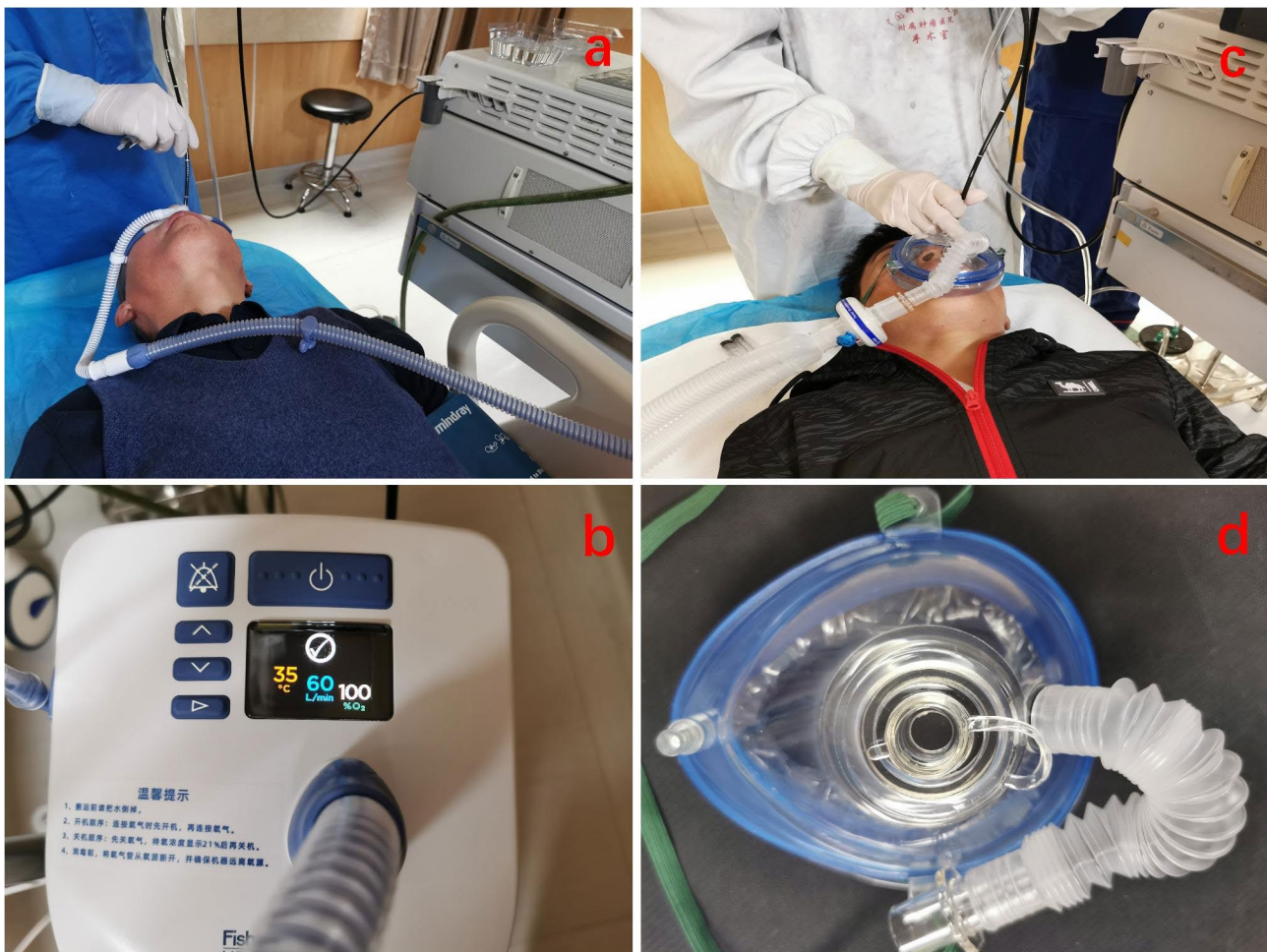
Fig. 2 The high-flow nasal cannula and endoscopic facemask. a and b: high-flow nasal cannula device; c and d: endoscopic facemask used in flexible bronchoscopy. Bronchoscopy was performed through the nasal route in a supine position