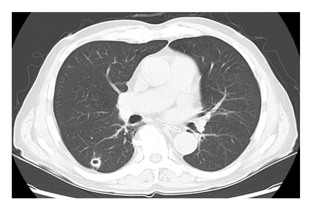
Fig. 1 Chest computed tomography

Chest computed tomography (CT) showed a 13-mm nodule with a cavity in S6 of the right lower lobe of the lung (Fig. 1). The cavity wall was irregular and had a